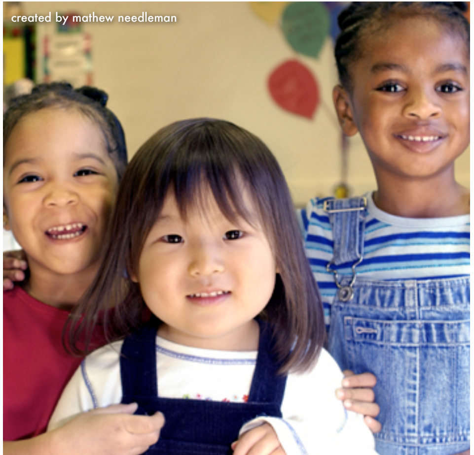
table of contents: Daily Schedule Classroom Map Class Demographics Class Procedures Class Rules and Values